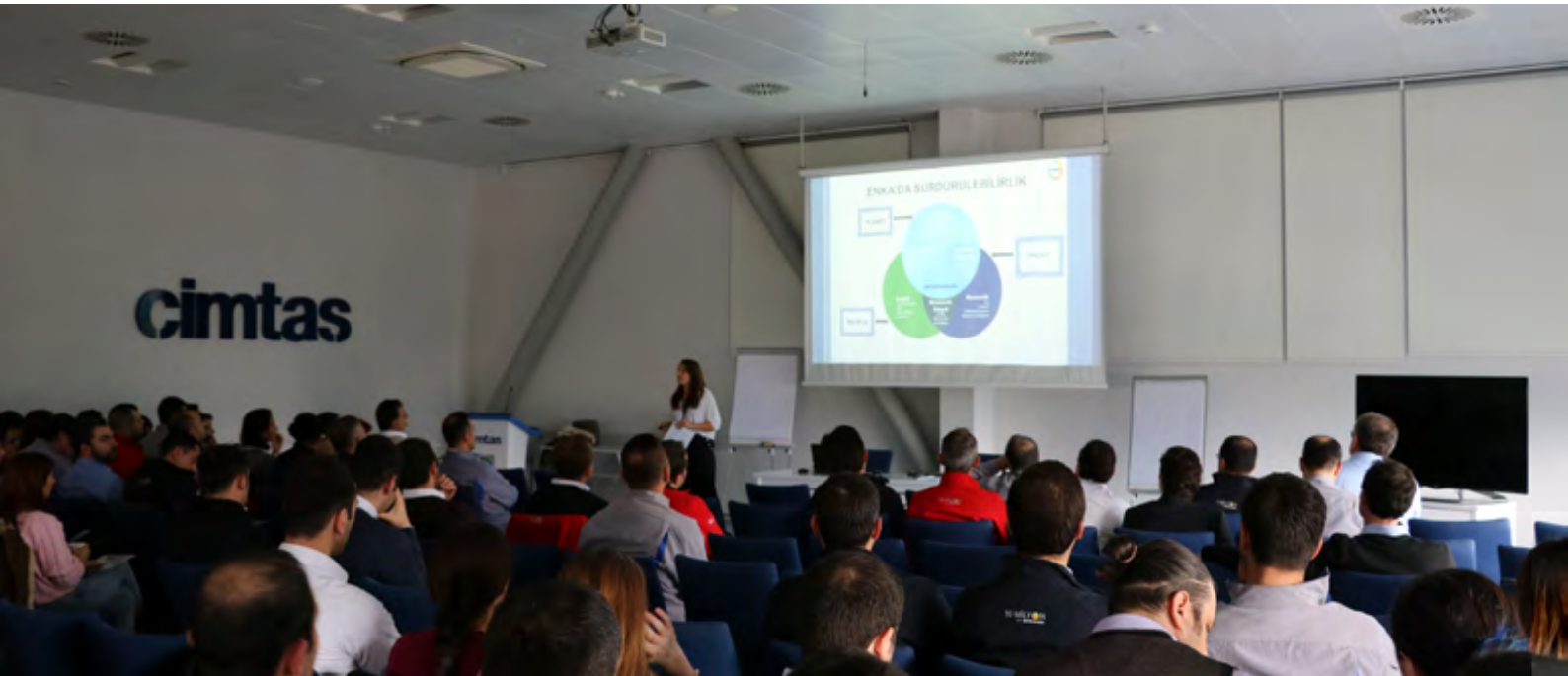
■ ENKA Material Sustainability Issues

After the review of all the issues assessed through the materiality analysis and considering ENKA’s social, environmental and economic impacts and the dynamics of the sectors where it is active, the expectations of various sustainability initiatives and indices and the stakeholders; the issues of Biodiversity, Management of Social, Economic and Environmental Impacts on Local Communities, Carbon Footprint and Energy Efficiency, Environmental and Social Compliance of Suppliers and Social Investment have been included among the material issues as well. The updated list of material sustainability issues is given in the table below.